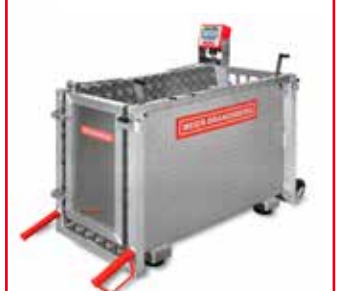
Mini piglet scales