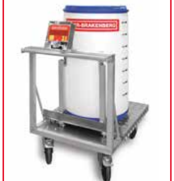
Barrel scales for chemical industry