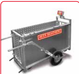
Wheel barrow type scales

develop concrete proposals and offer the ideal solution. When developing our products a high value is placed on premium quality materials and functionality!