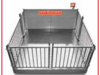
Three-way crossing at ramp