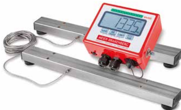
Balance beams from 100 cm in length can be shortened twice by 15 cm. Weighing beams up to 6 m long available on request.

To upgrade existing scales, we offer premium quality balance beams made of aluminium and stainless steel. The weighing electronics have an animal weighing program and the scale tares itself electronically. The weighing unit has waterproof load cells and is also protected against mice thanks to rodent resistant cables. Standard operation via mains adaptor can also be implemented with a battery.