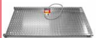
Weighing platform for 200 cows operation at the concentrated feed station