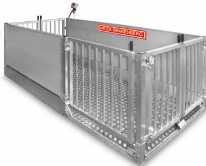
Stationary scales with extra side gate