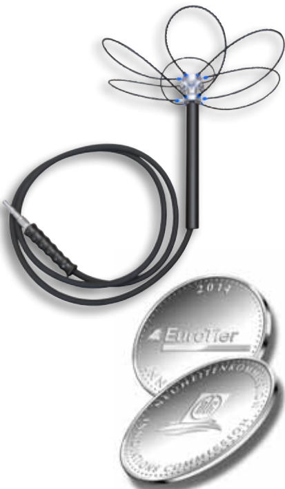
Protected utility model